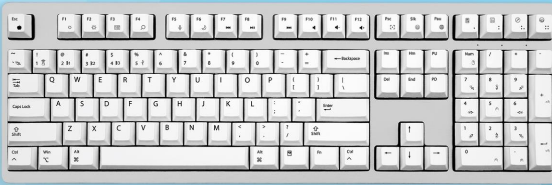
W108XM, Silver finish

Our Pine Series professional, mechanical keyboards connect to macOS, Windows, Android, iOS, and Linux devices